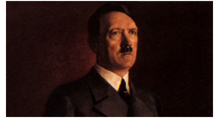
Hitler's Teeth Reveal Nazi Dictator's Cause of Death

A poor and underdeveloped state, Oaxaca relies mainly on the commercial value of its forestry products, fruit and vegetable crops and handicrafts created by indigenous artisans to support its economy. Past mismanagement has squandered some resources, and poor transportation systems have hindered the movement of produce and raw materials. In some cases, disagreements among indigenous cultures have prevented the development of the region's resources.